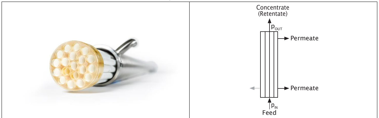
Figure 1: tubular module

The major advantage of the tubular modules is their ability to achieve a high concentration without blockages even when media have a high solids content. Tubular module systems do not require any expensive prefiltration which is essential with other systems which have a thinner channel cross-section. Another major advantage of the tubular modules is that they can be cleaned thoroughly.